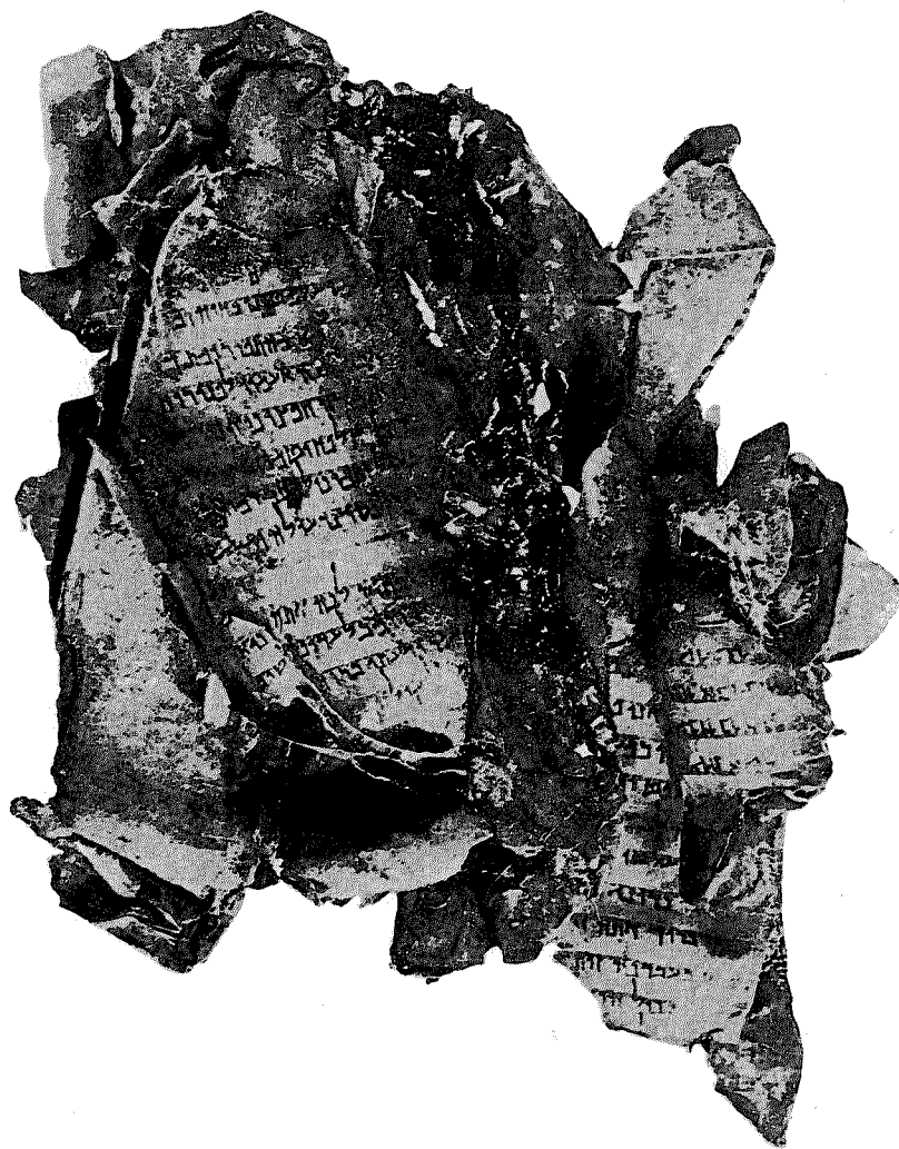
צויר 13 : מגילת ההודיות (הקטעים) עם פתיחתה