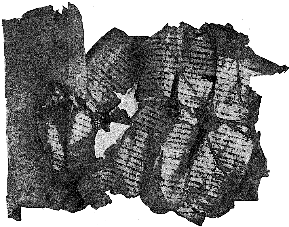
צור 15 : מגילת ההודיות (יריעה שניה) עם פתיחה