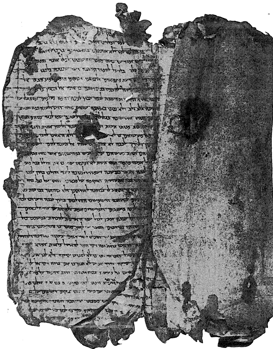
צוֹר 14 : מגילת הַהוֹדוֹת (יריעה ראשונה) עם פתיחתה