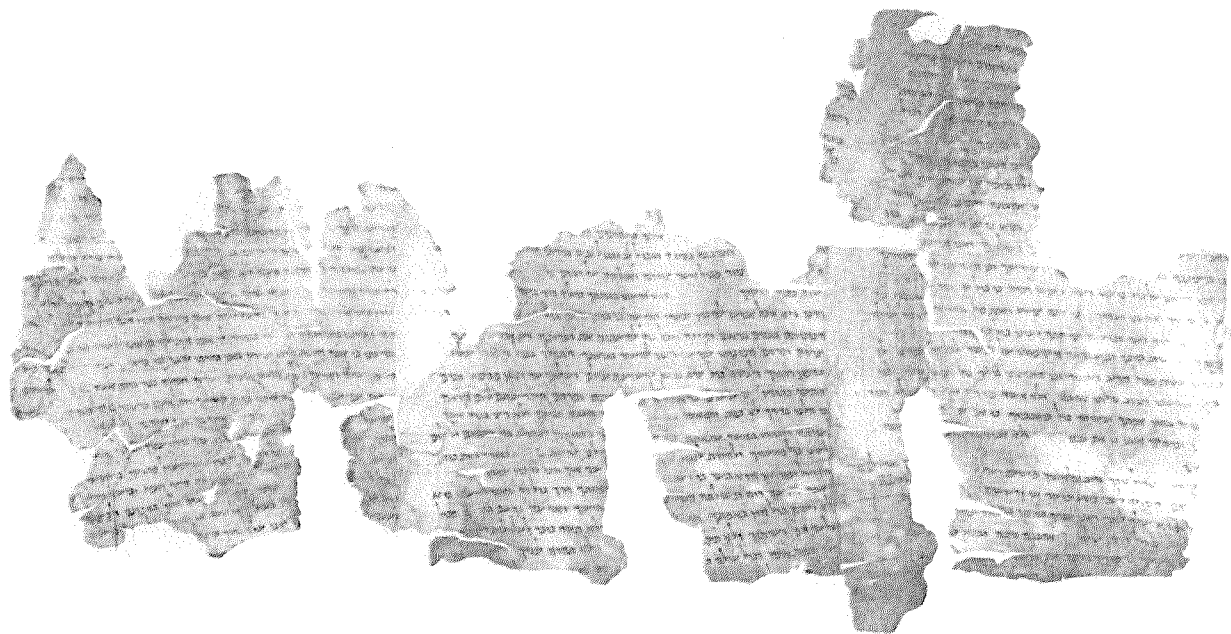
ציורים 22:23 : מגילת ההודיות, יריעה שלישית ורביעית