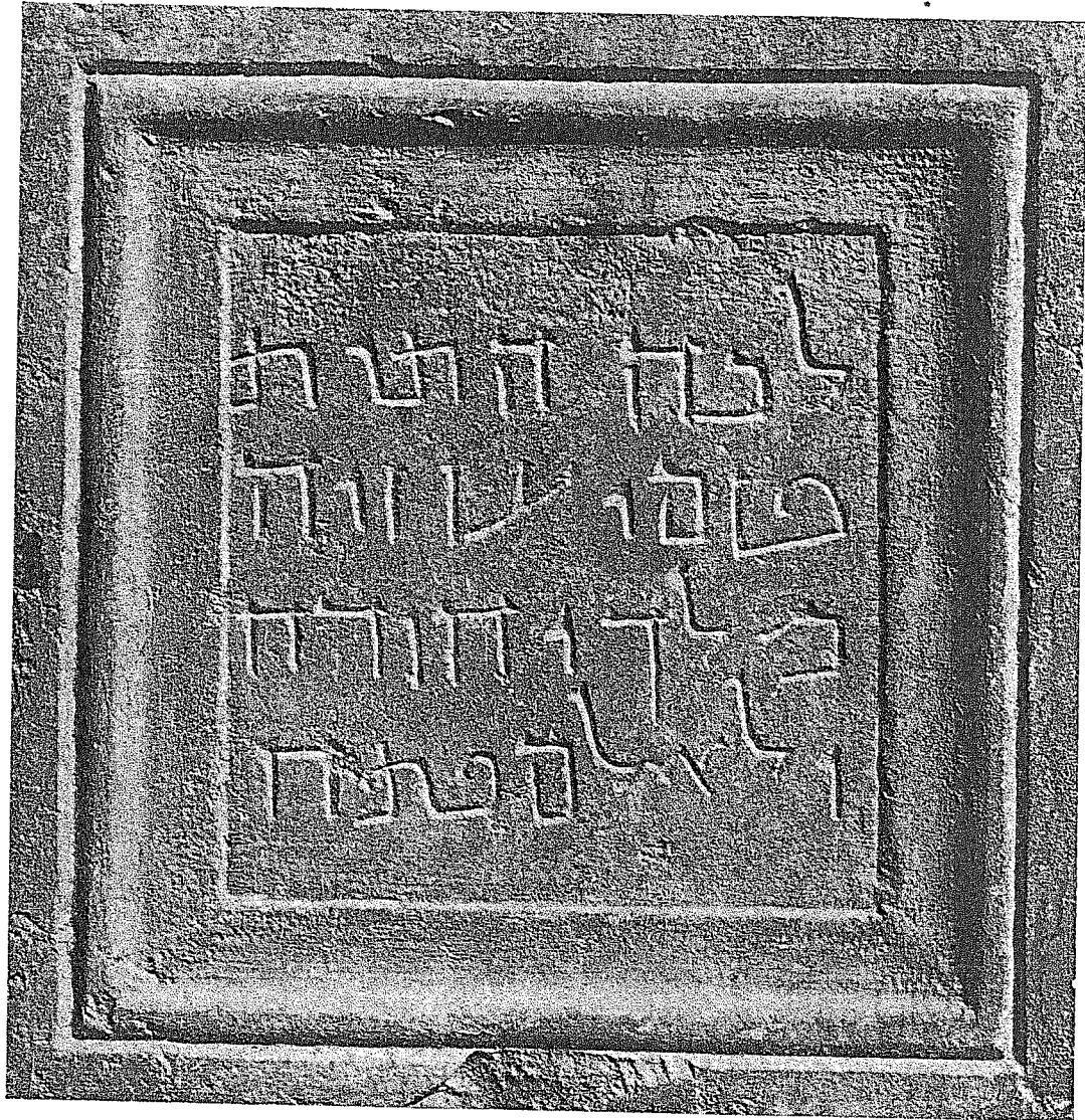
ציור 26 : ציון עזיהו מלך יהודה