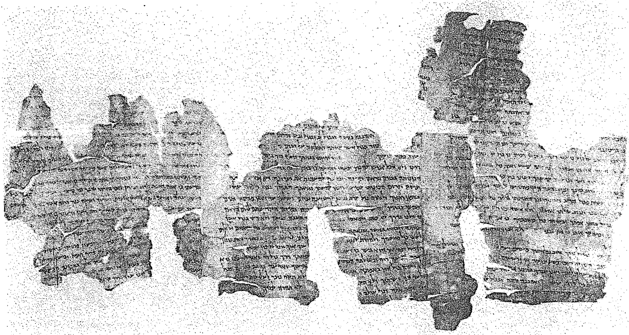
צוירים 2223 : מגילת ההודיות, יריעה שלישית ורביעית